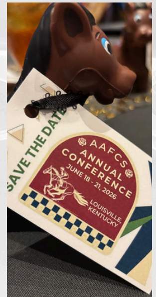
Save the date for KY!