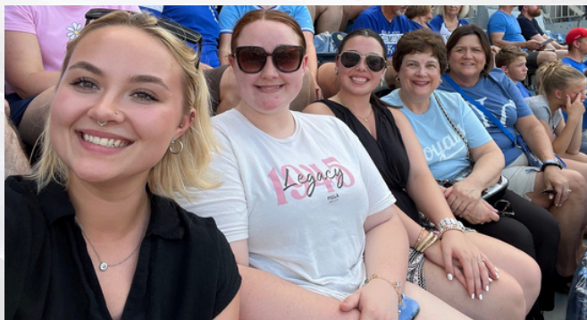
Student unit and other members enjoying a Kansas City Royals game.