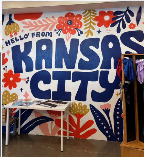
Hello from Kansas City!